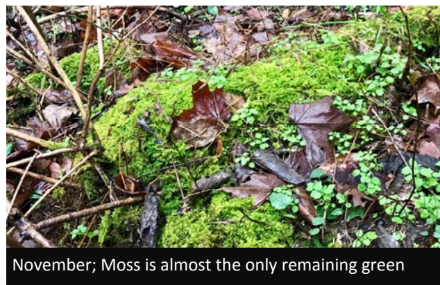
November; Moss is almost the only remaining green