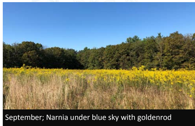
September; Narnia under blue sky with goldenrod

Many of our alumni are probably used to thinking of Camp Onas in its summer glory... lush and green and humid, or perhaps a bit dry and dusty, depending on the kind of summer it is ... we thought it would be fun to send along some photos of Camp Onas from this fall and early winter, so you can picture being here at Onas this time of year.