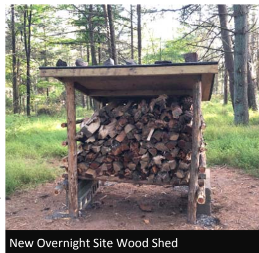
New Overnight Site Wood Shed

interested camper, please make sure you remind them that now is the time to sign up for camp!