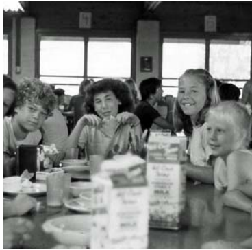
A. Dining Hall _____