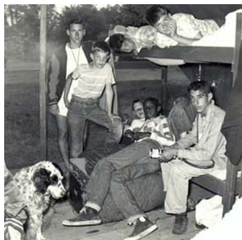
E. Mugwumps Boys Tent _____