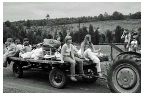
F. Wagon ride on the Girls Side _____