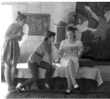
D. Peter Pan Weekend _____

F: 1974 E: 1954 D: 2011 C: 1932 B: 1993 A: 1982